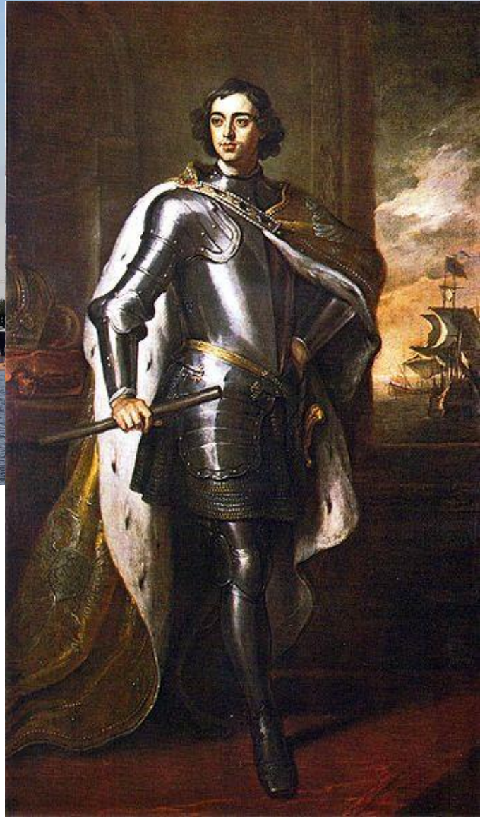
Portrait of Peter I Godfrey Kneller, 1698