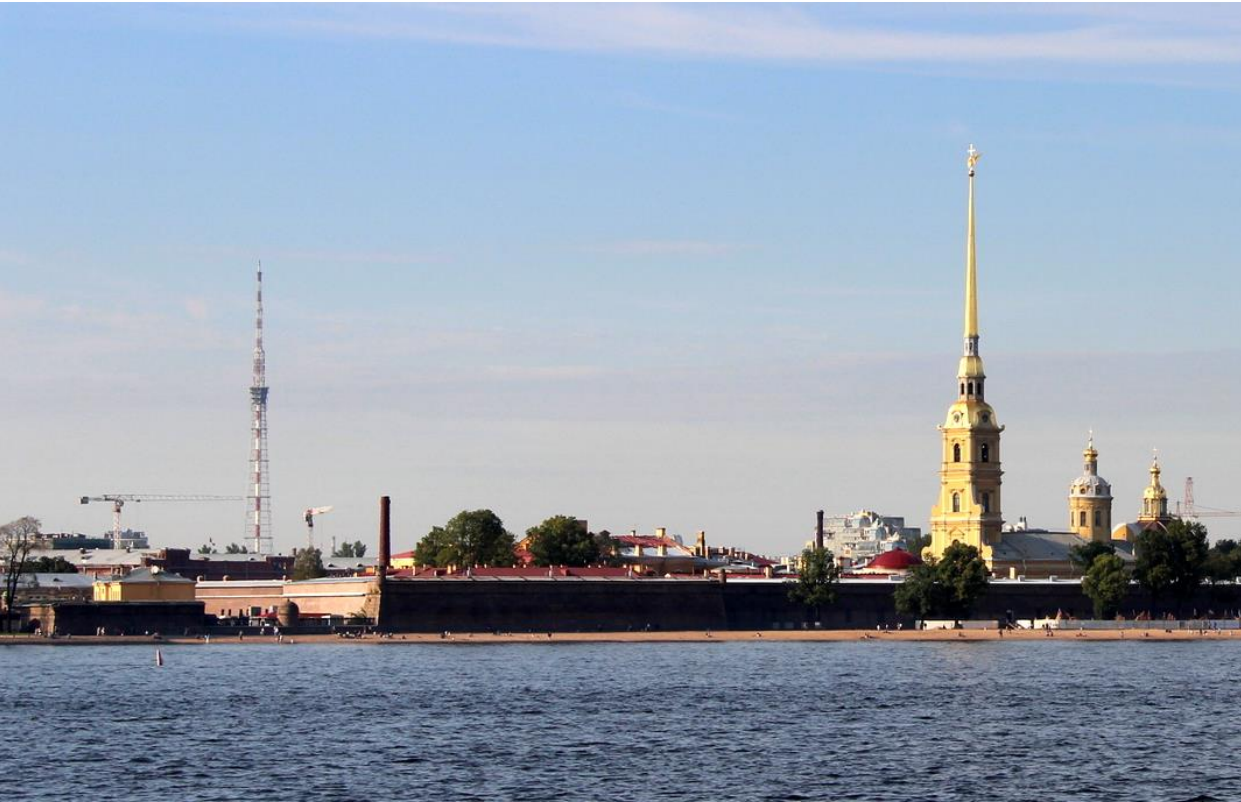
Petropavlovskya fortress, after Saint Apostles Peter and Paul