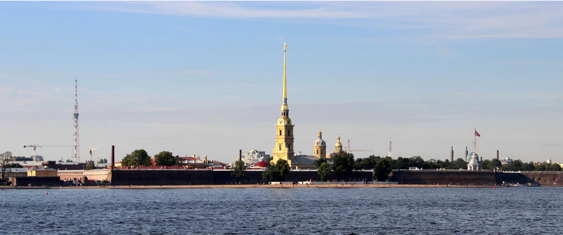
Petropavlovskya fortress, after Saint Apostles Peter and Paul